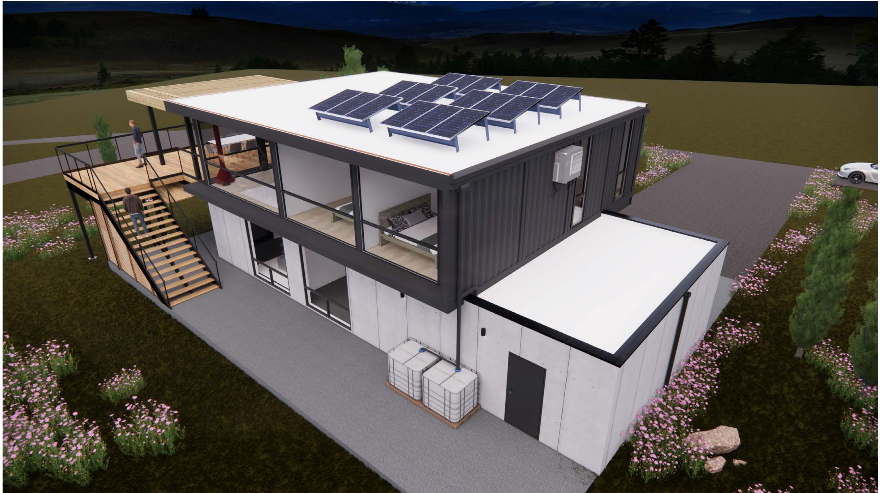
Framed View: Solar Panels and Rainwater Collector