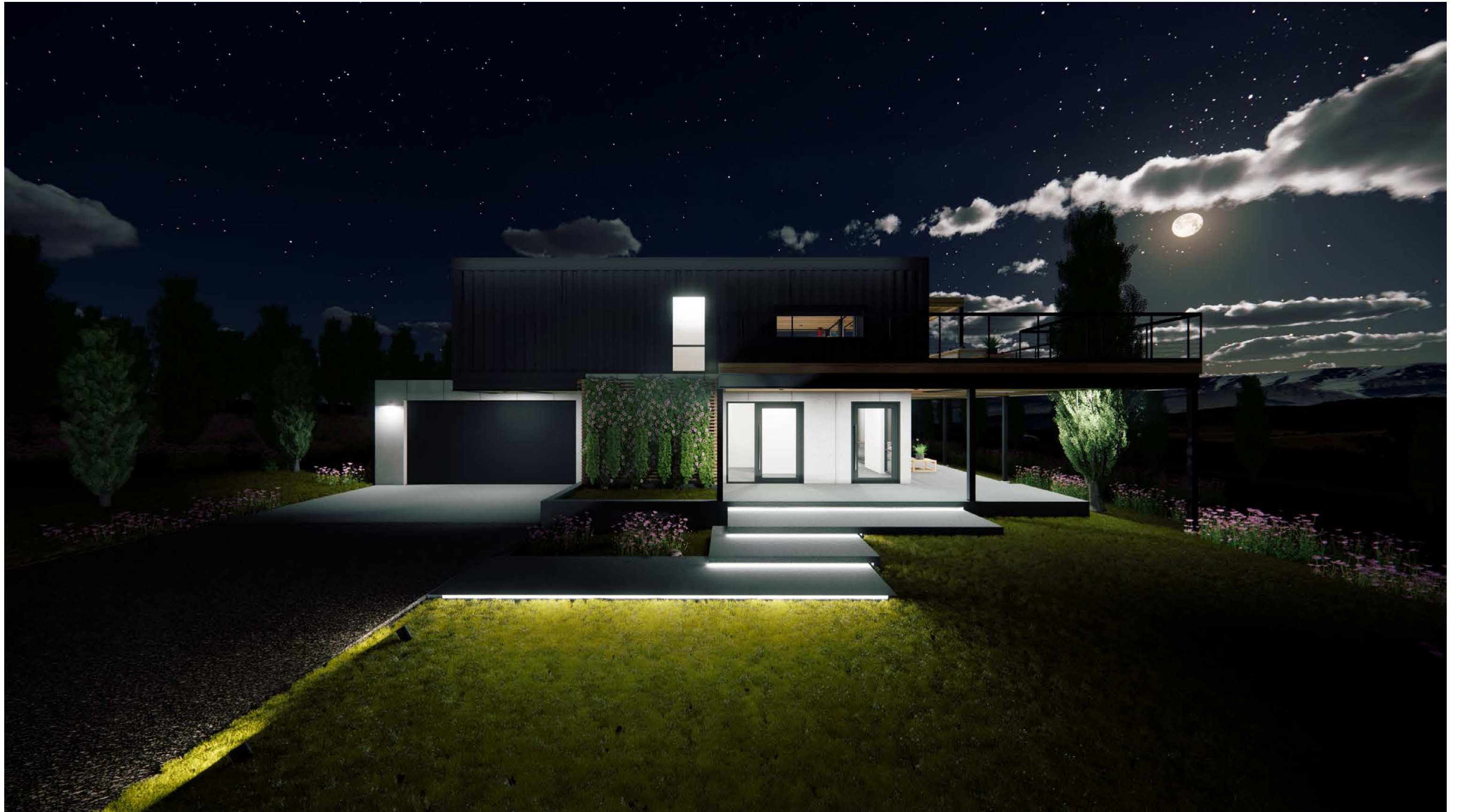
Overview from North