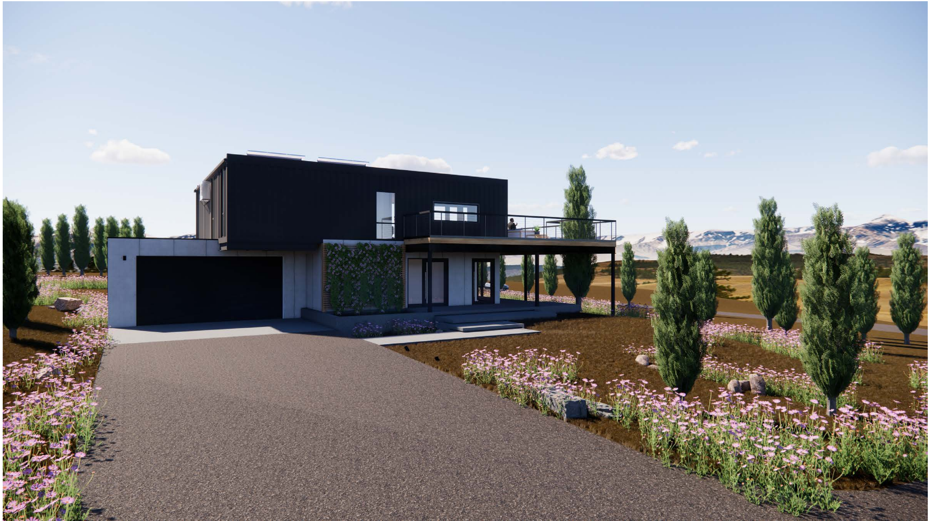
Front (N) Exterior