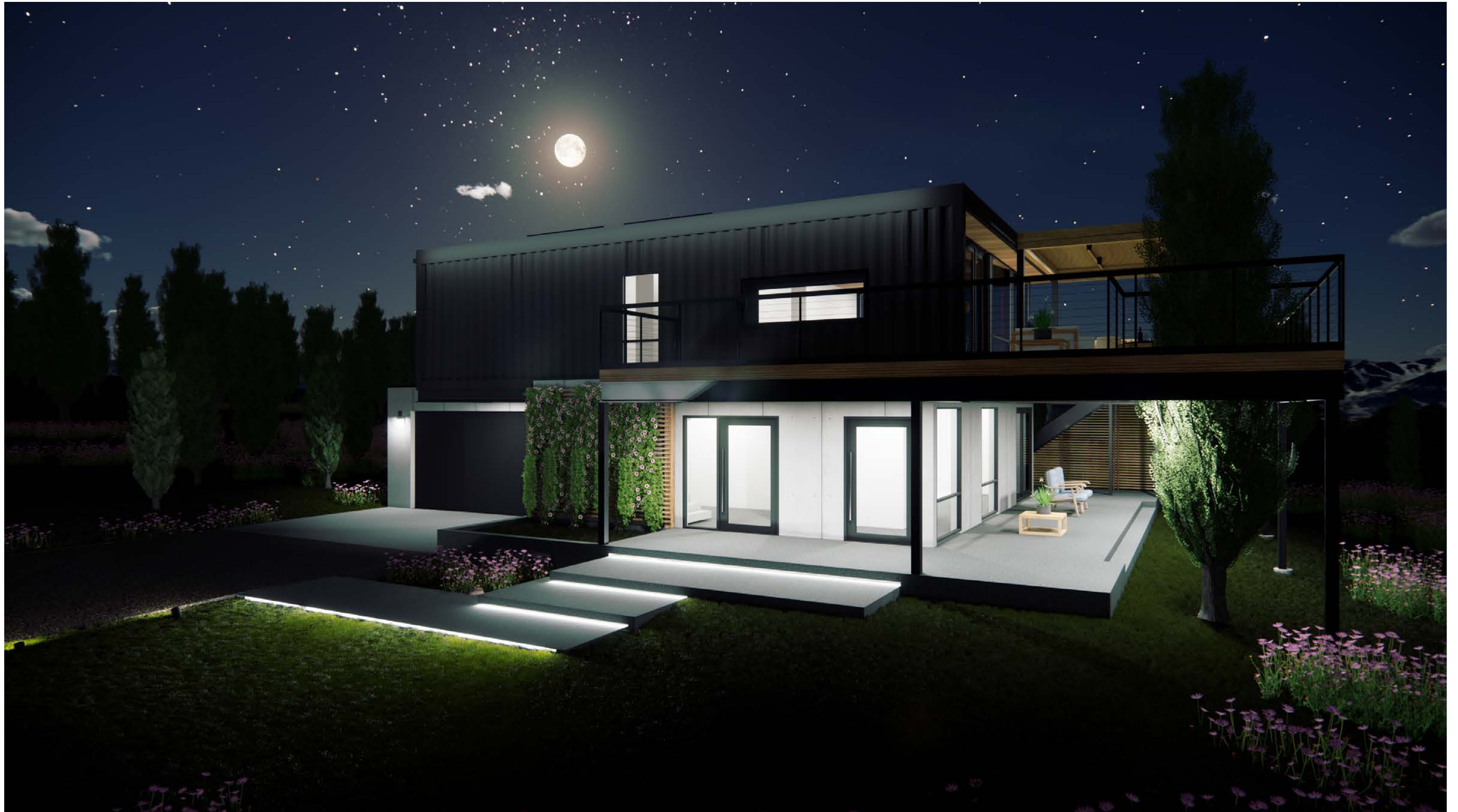
Northwest Exterior (Night)