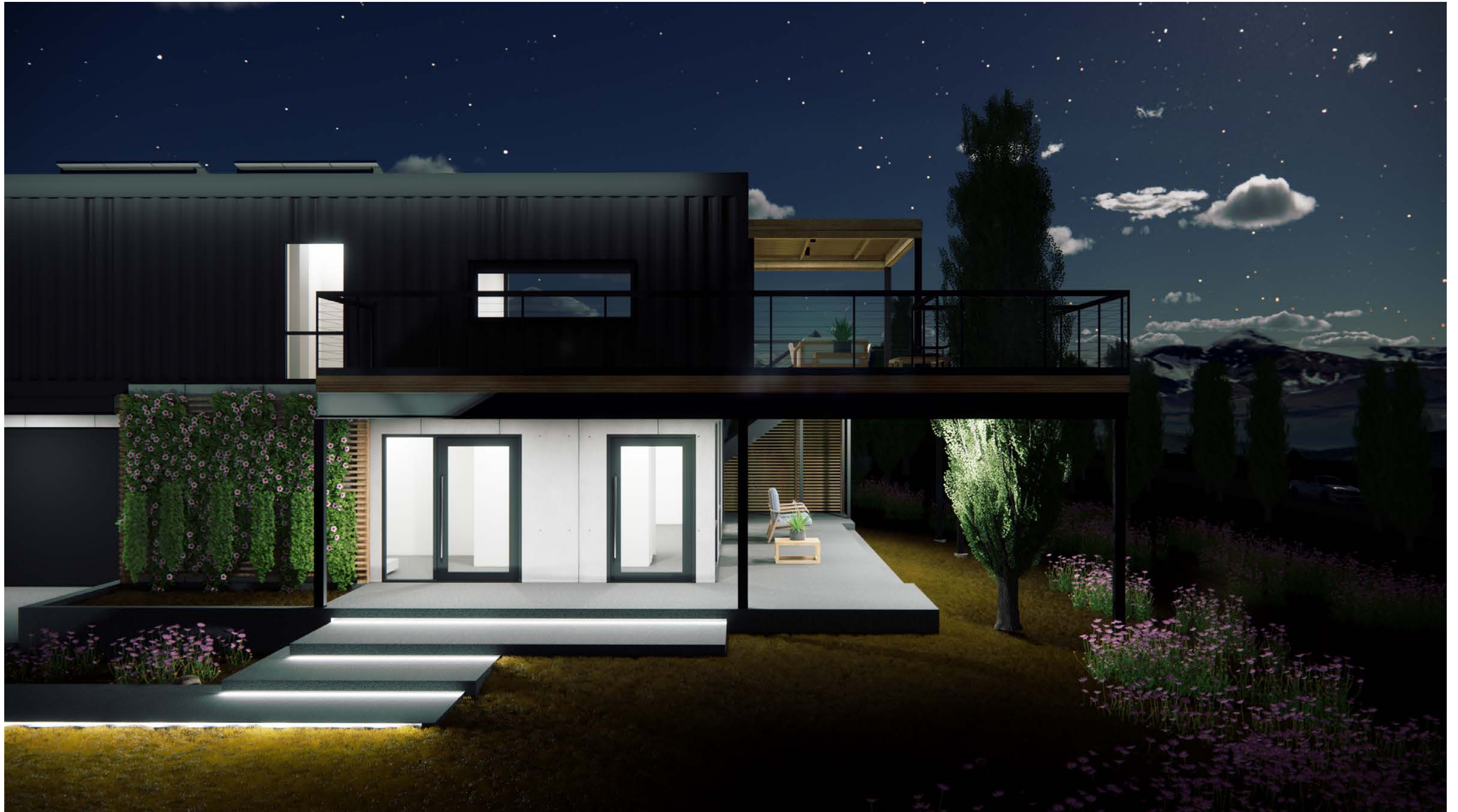
Framed View: Entrance and Framed Landscape (Night)