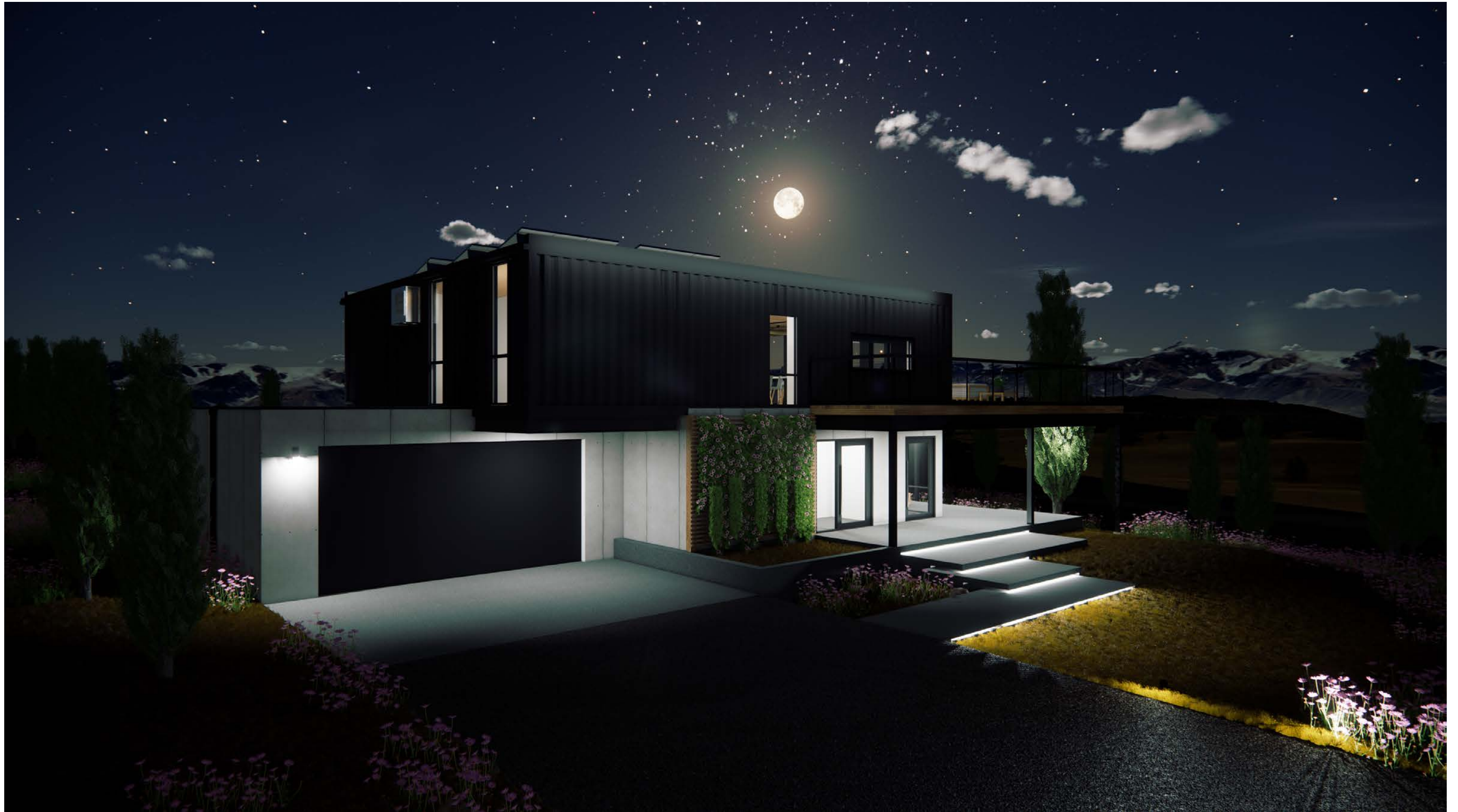
Northeast Exterior (Night)