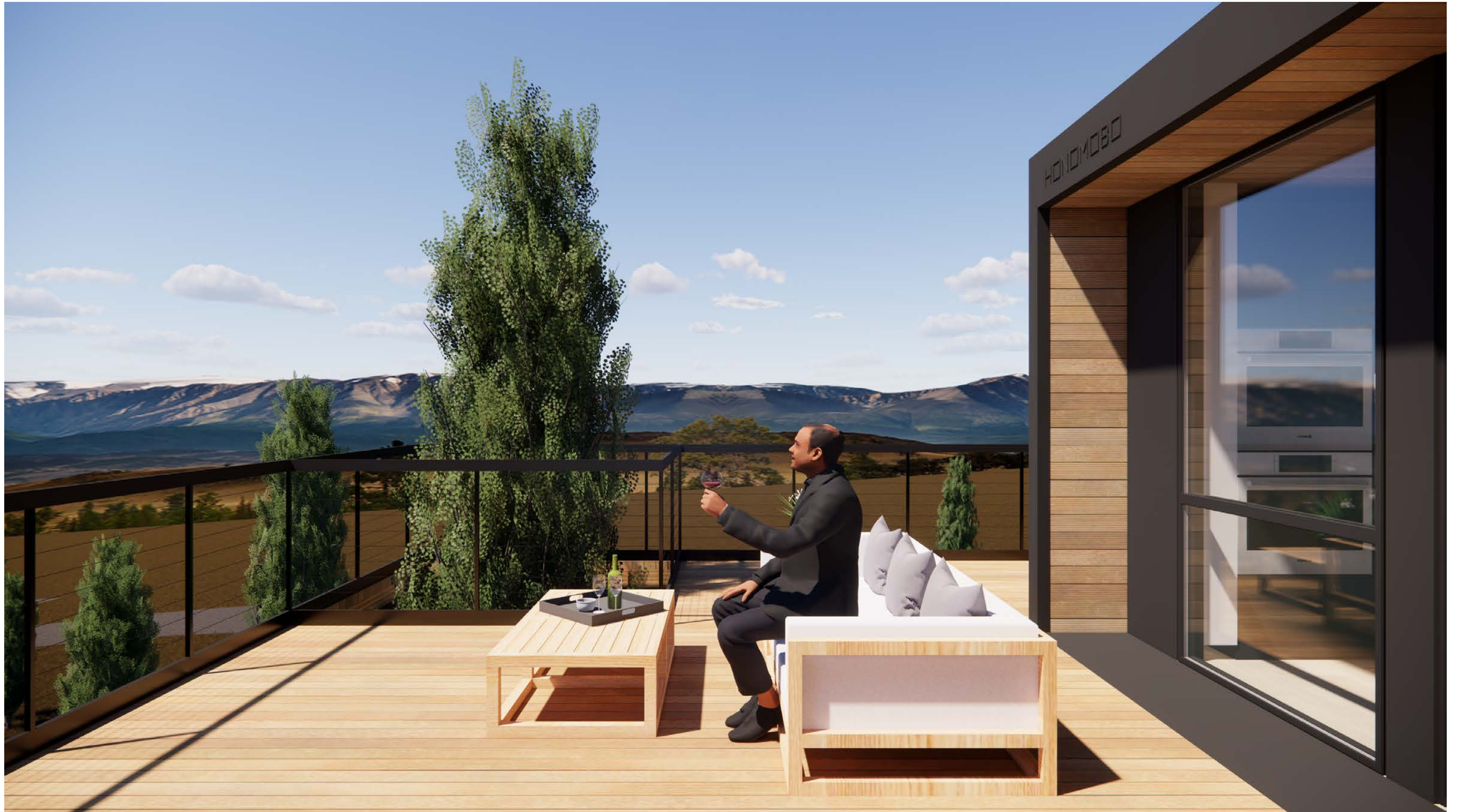
Framed View: Wood Deck/Balcony with Framed Landscape