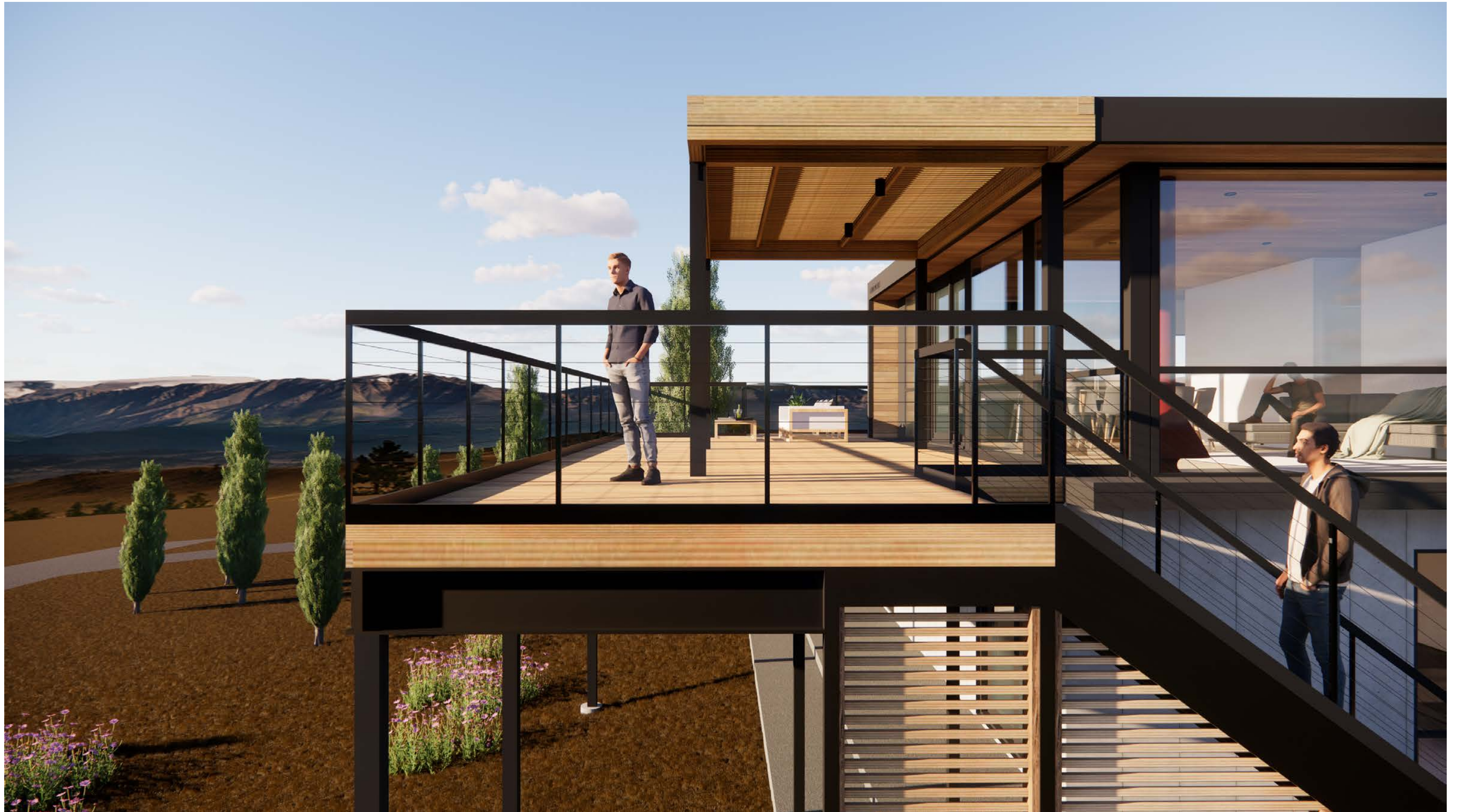
Framed View: Wood Deck/Balcony