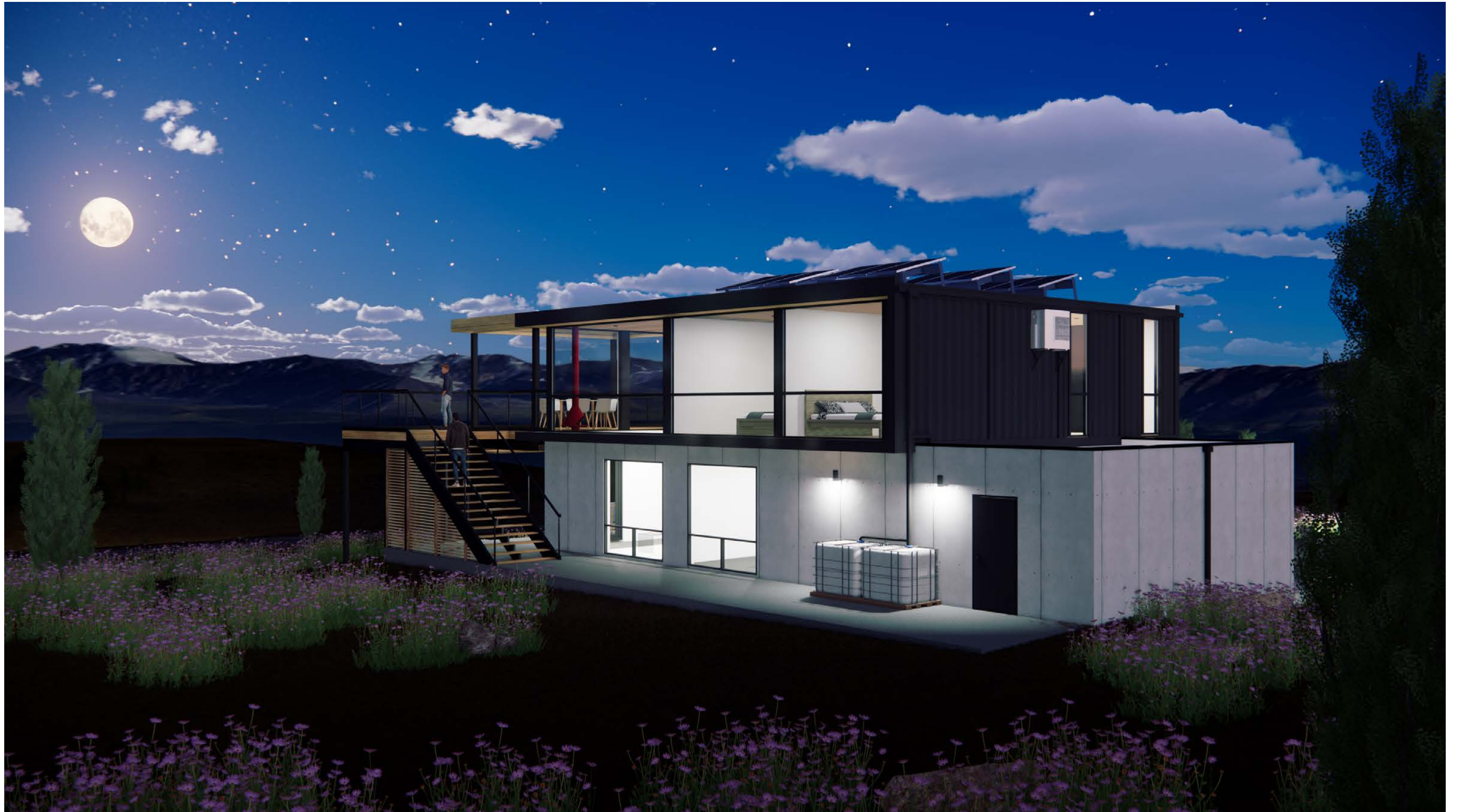
Southeast Exterior (Night)