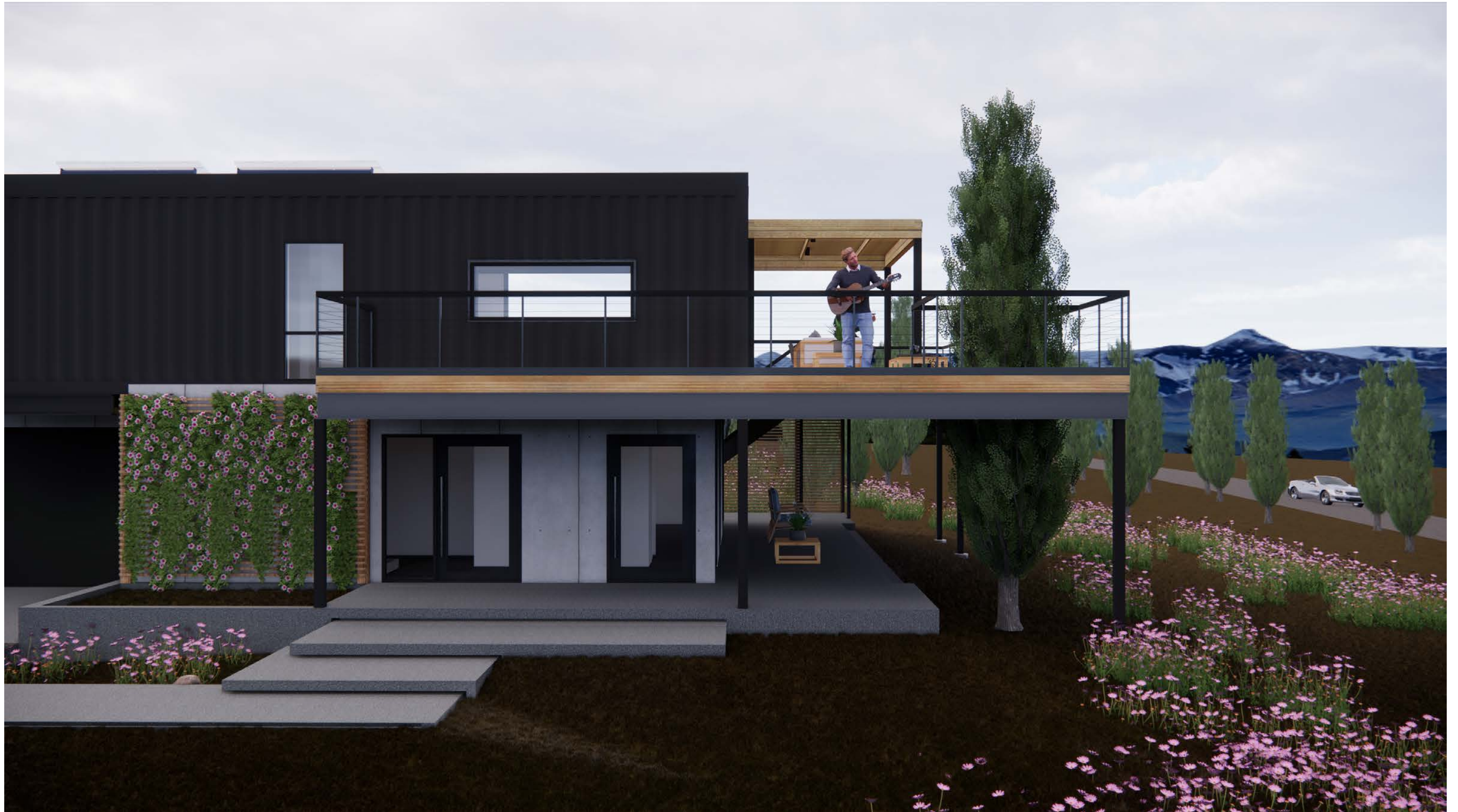
Framed View: Entrance and Framed Landscape