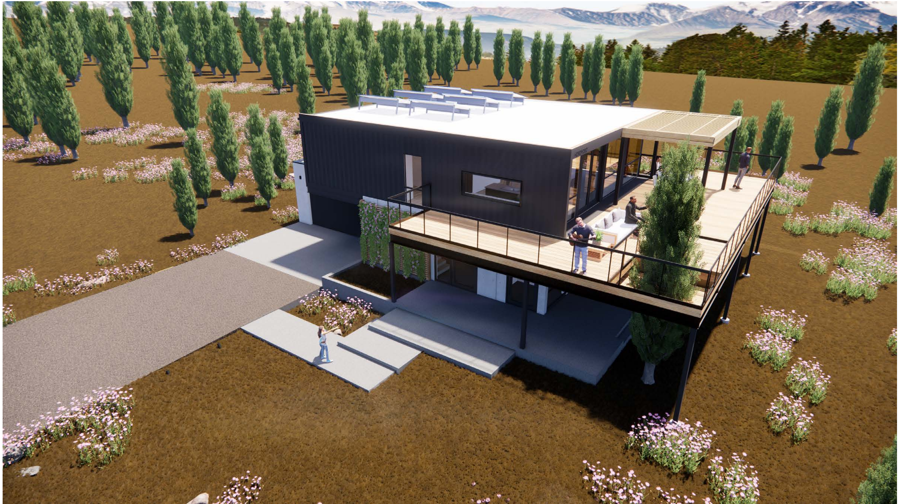
Northwest Bird's-Eye View