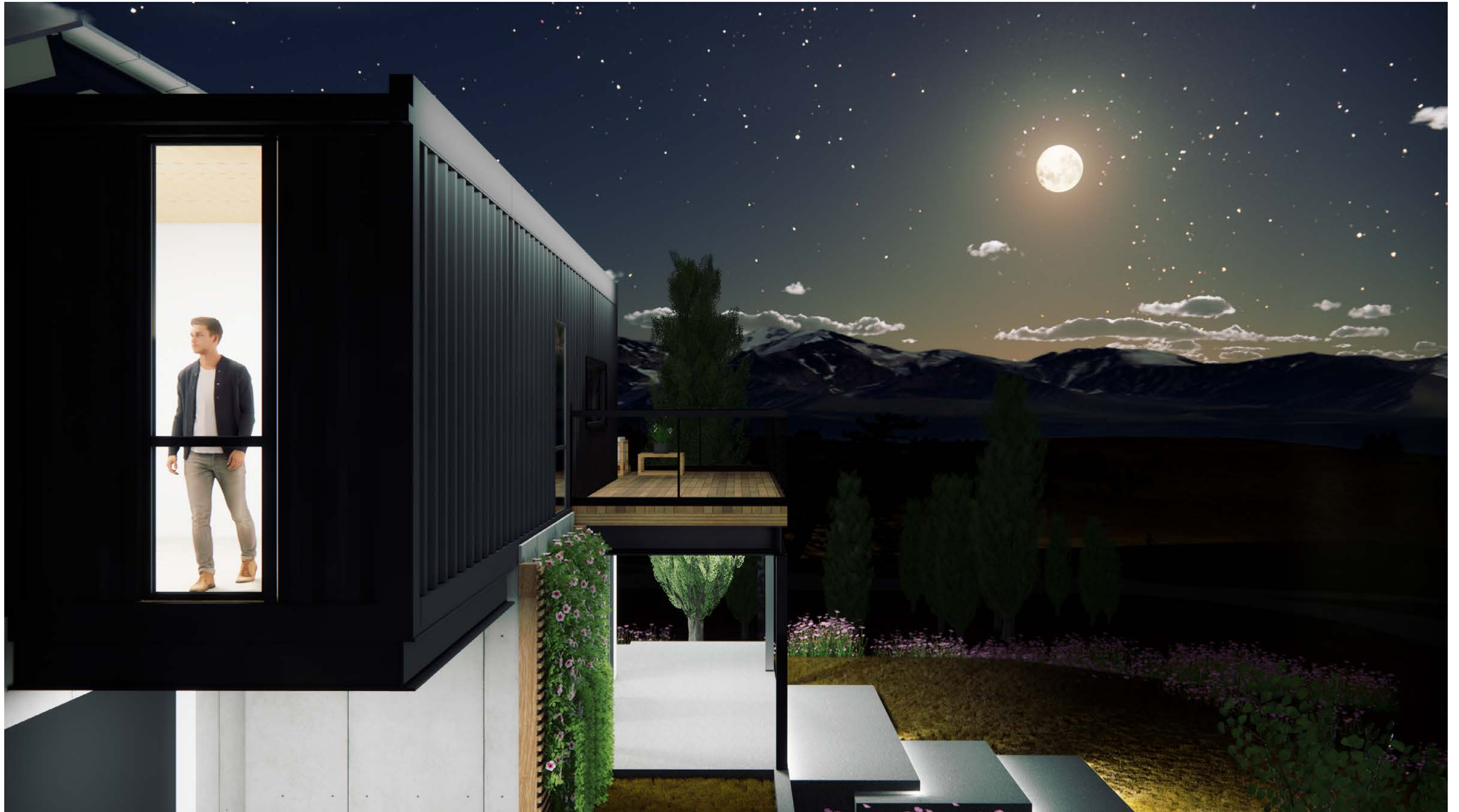
Framed View: The Interaction Between HONOMOBO and Nature