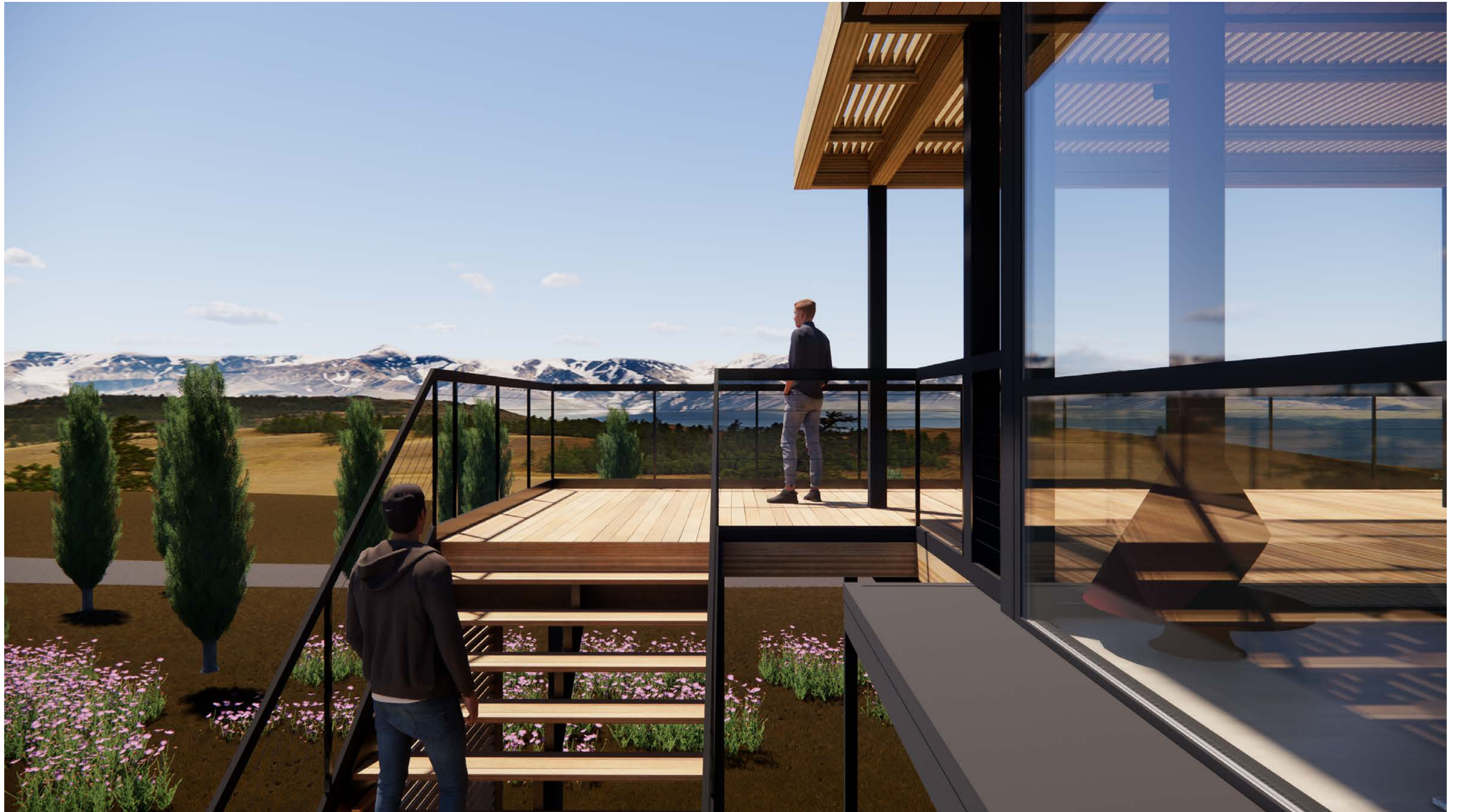
Framed View: Outdoor Stair and Overlook Space