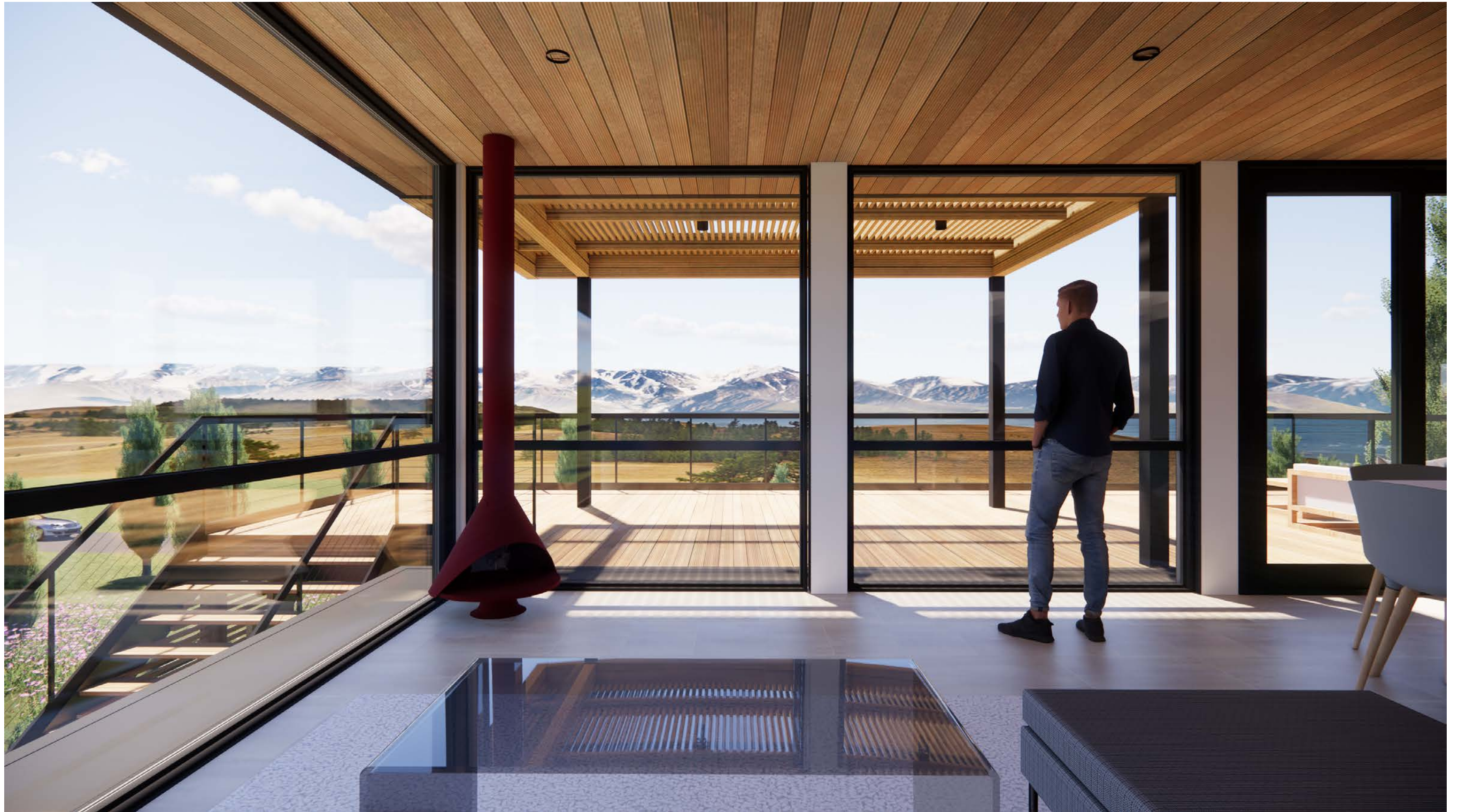
Framed Interior View: Living Room in HONOMOBO HO4