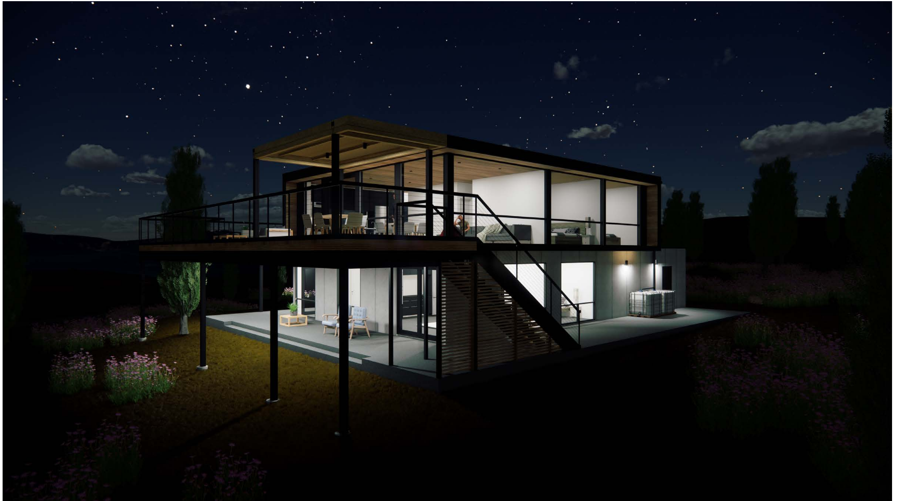
Southwest Exterior (Night)