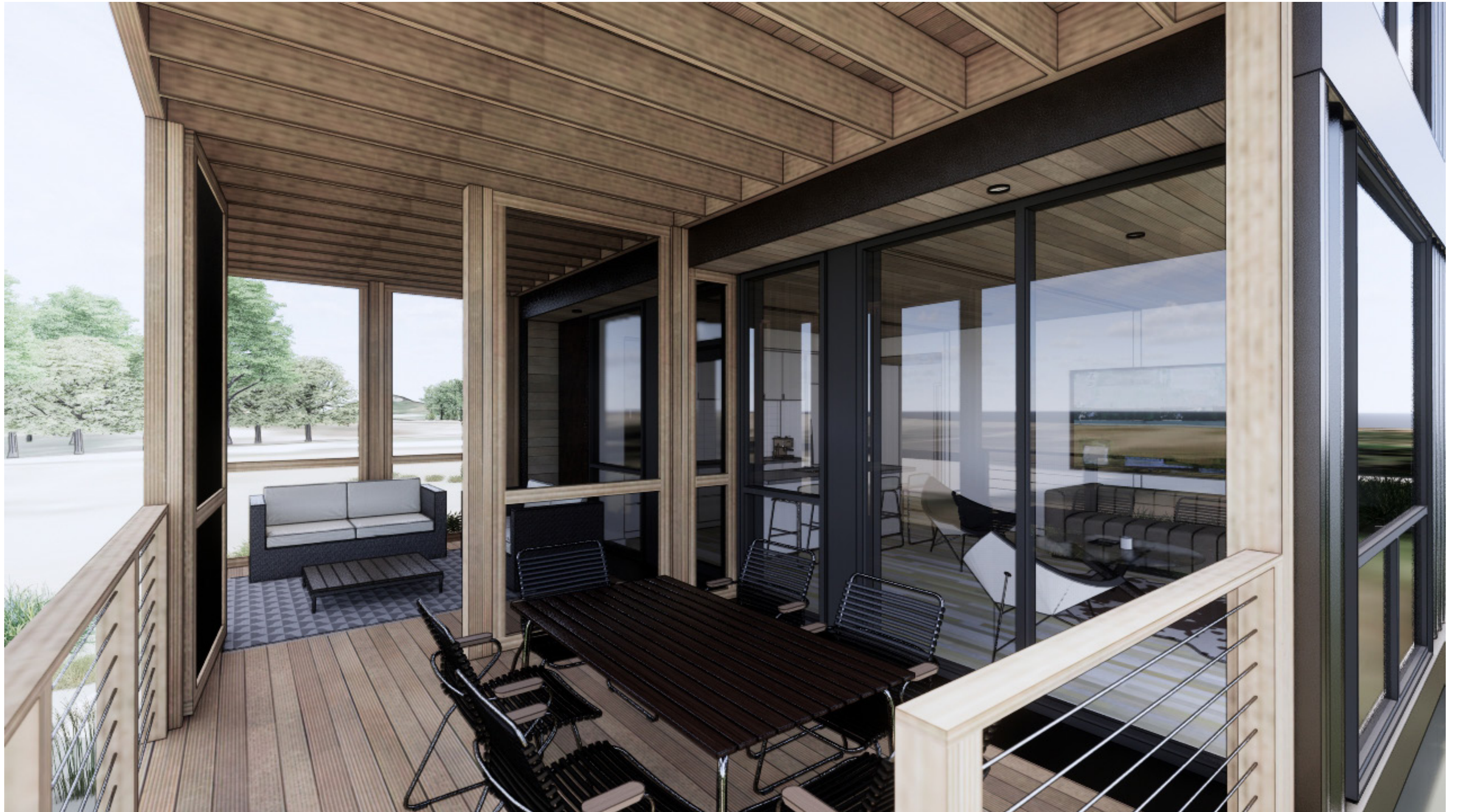
First Floor Deck and Screen Room