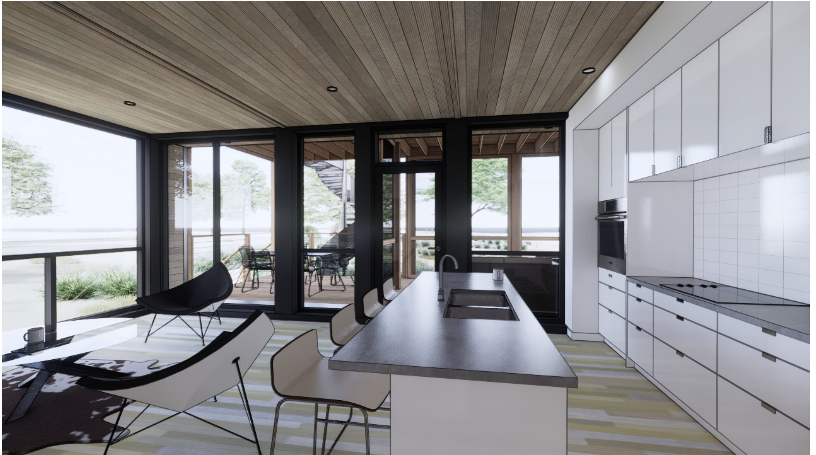
First Floor Unit Interior