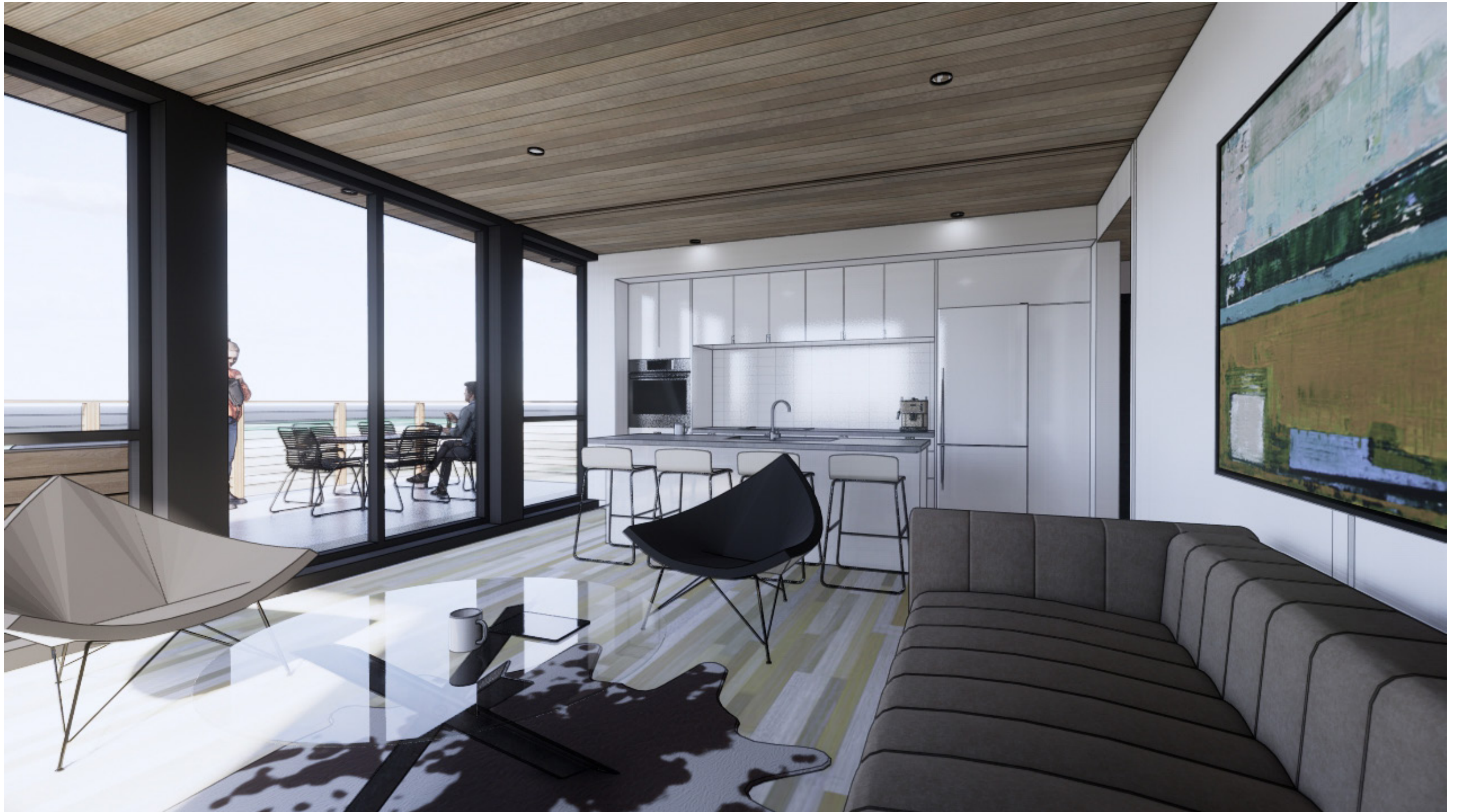
Second Floor Unit Interior