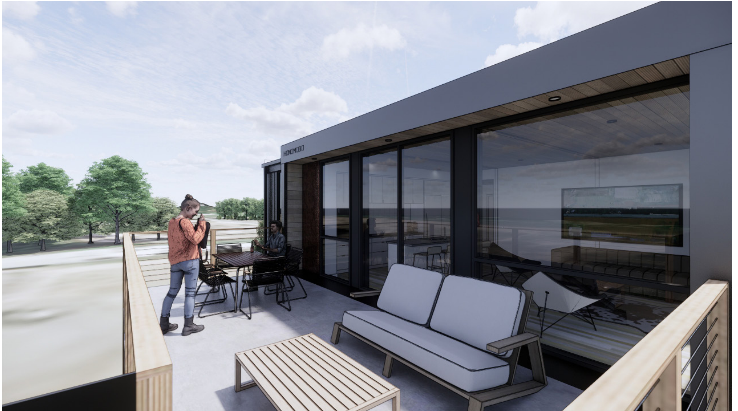
Second Floor Unit Deck/Balcony