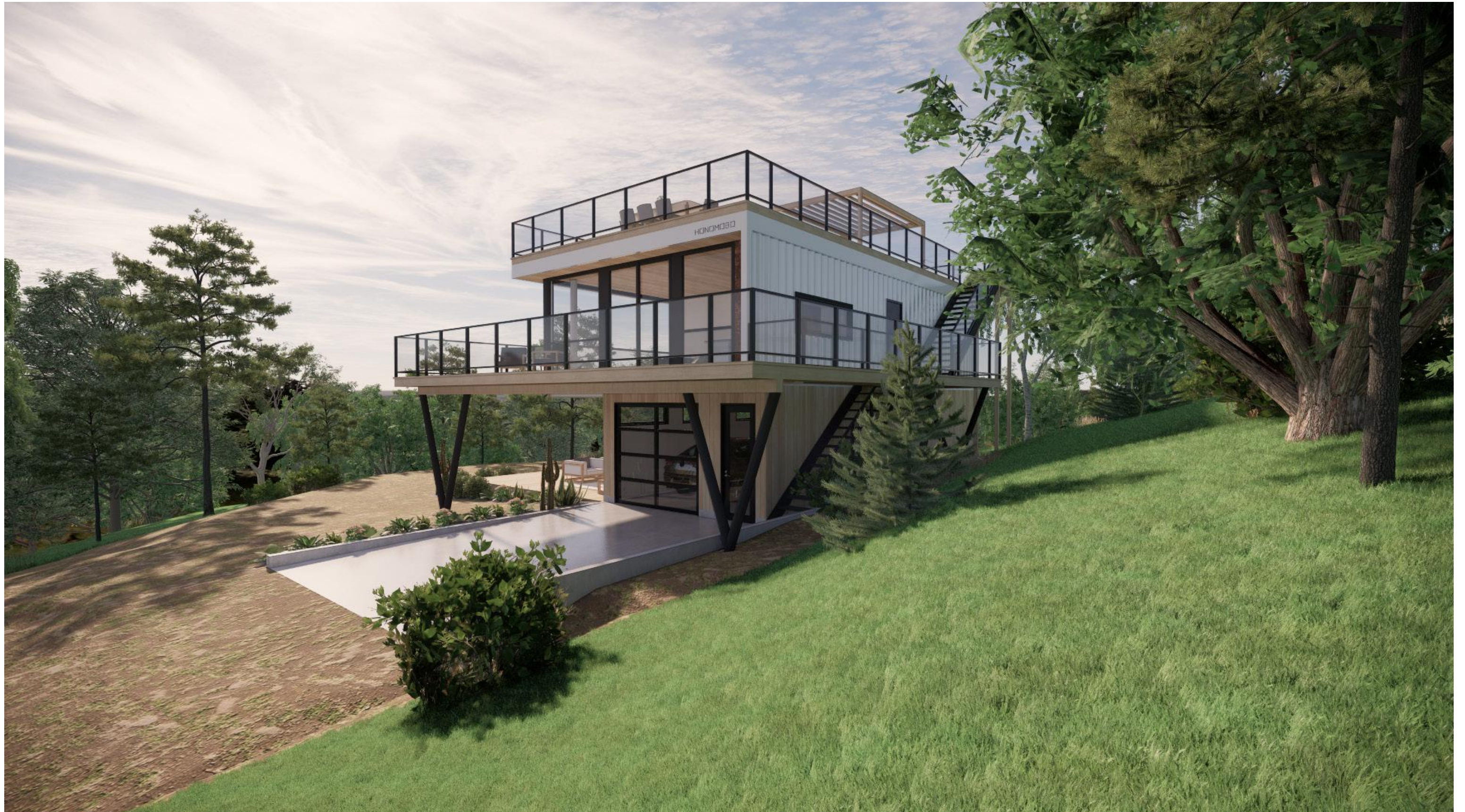
North East Exterior