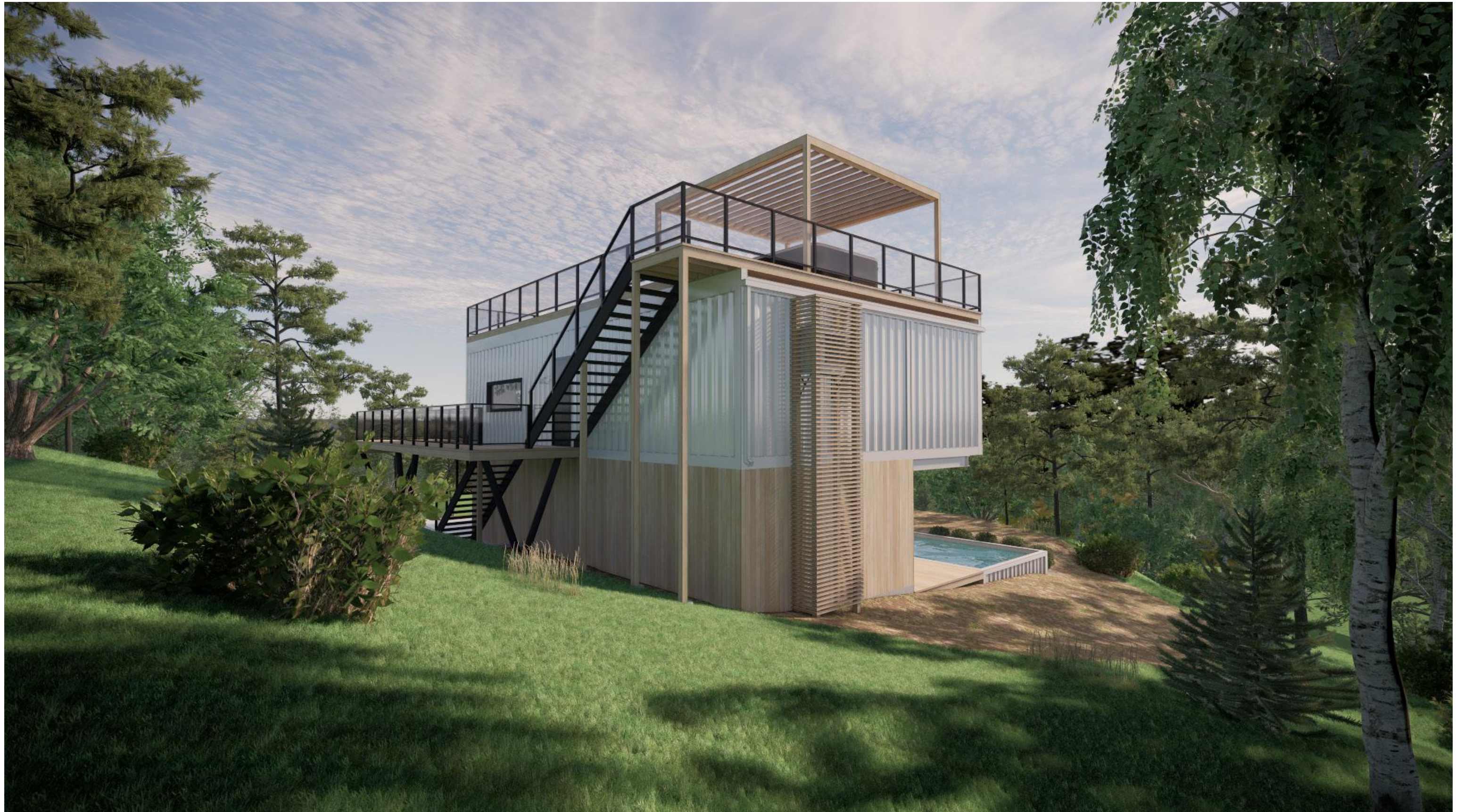
North West Exterior