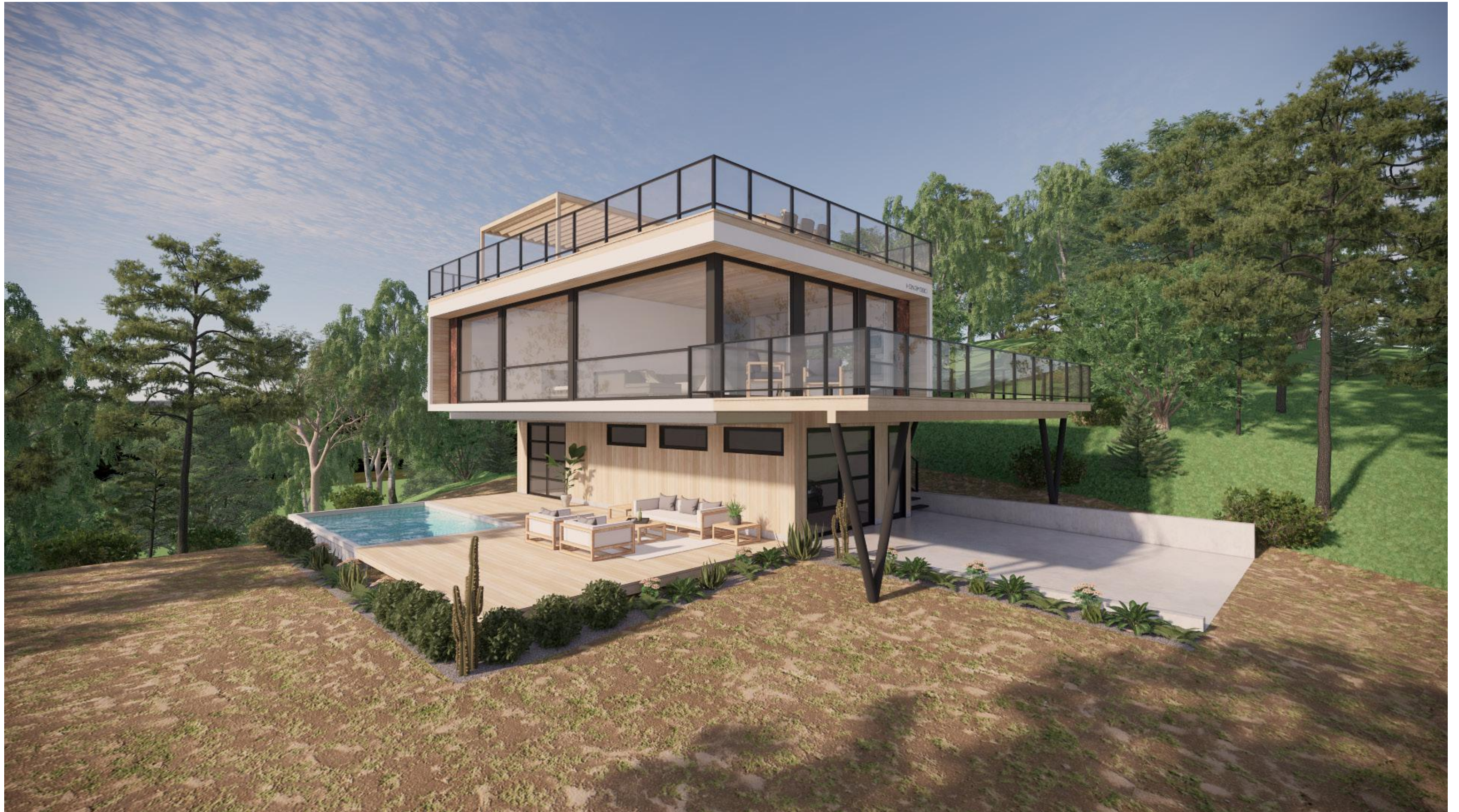
South East Exterior