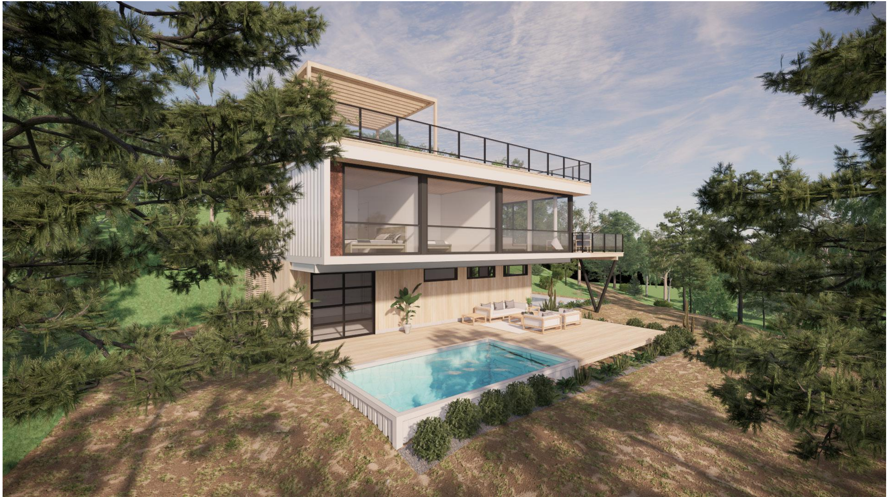
South West Exterior